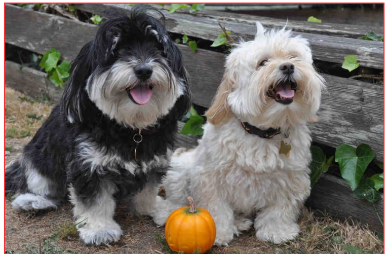
Oliver & Comet smile and wait for their treats also!