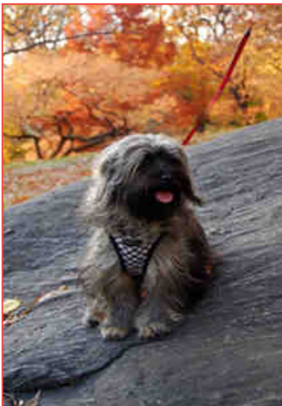
Kubrik is out enjoying a gorgeous fall day.

6. Trick or treating is fun, but during peak visiting hours, please keep your Hav in a separate room. Too many strangers dressed up like goblins that show up at the front doors can be scary and stressful!