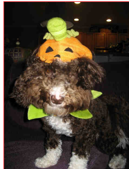
Scooter is ready for some good ol' fashioned trick or treatin' .